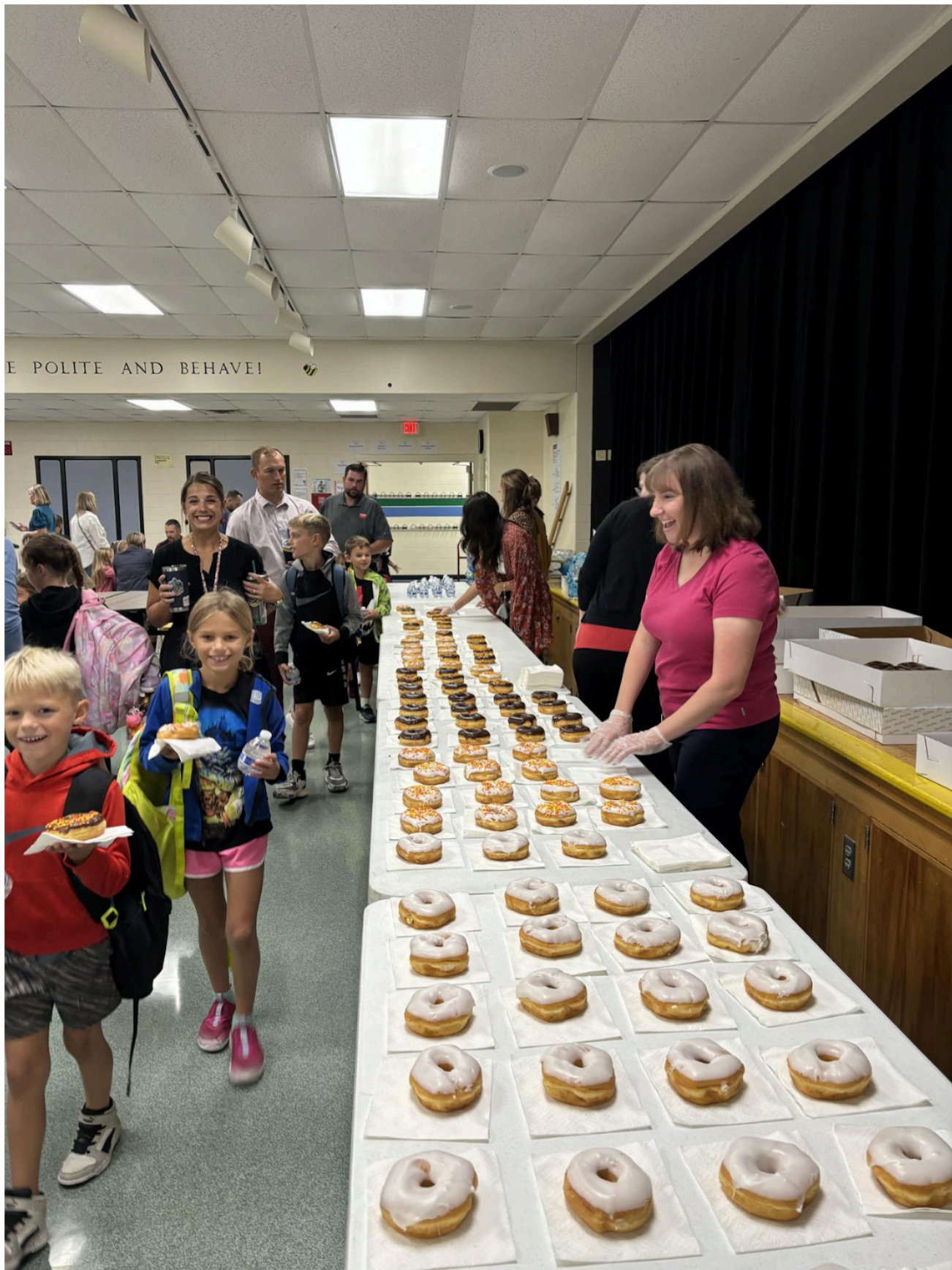
Donuts with Grownups was a huge success. It was wonderful to see so many families and a huge thank you to our Parent Boosters!